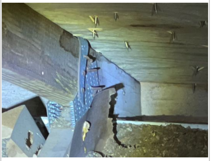
Strap- Opposing Side