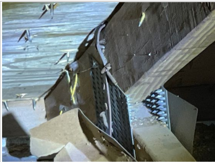
Strap- Anchor Side